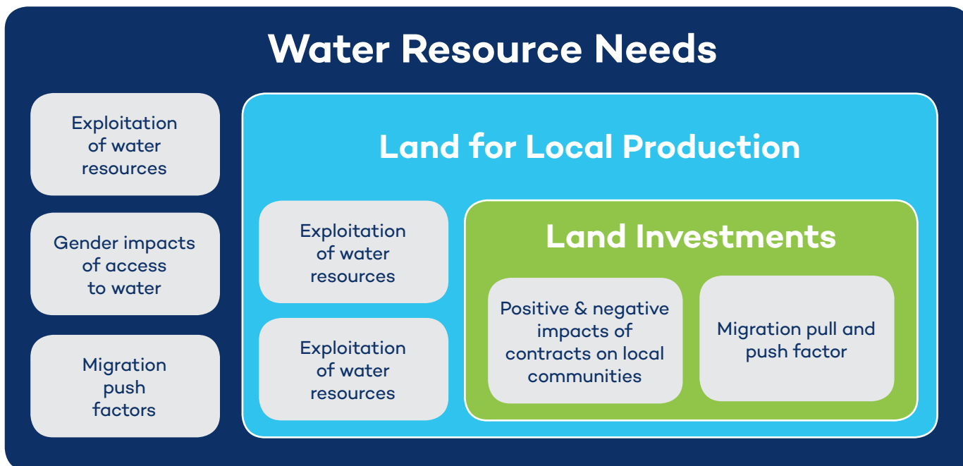
Figure 1. Cascading impacts of agricultural investments on people and environment

In order to reduce negative impacts and increase benefits, a key finding of IISD research is that policy matters—more specifically, the design of benefits to communities and adherence to environmental standards—are critically important.