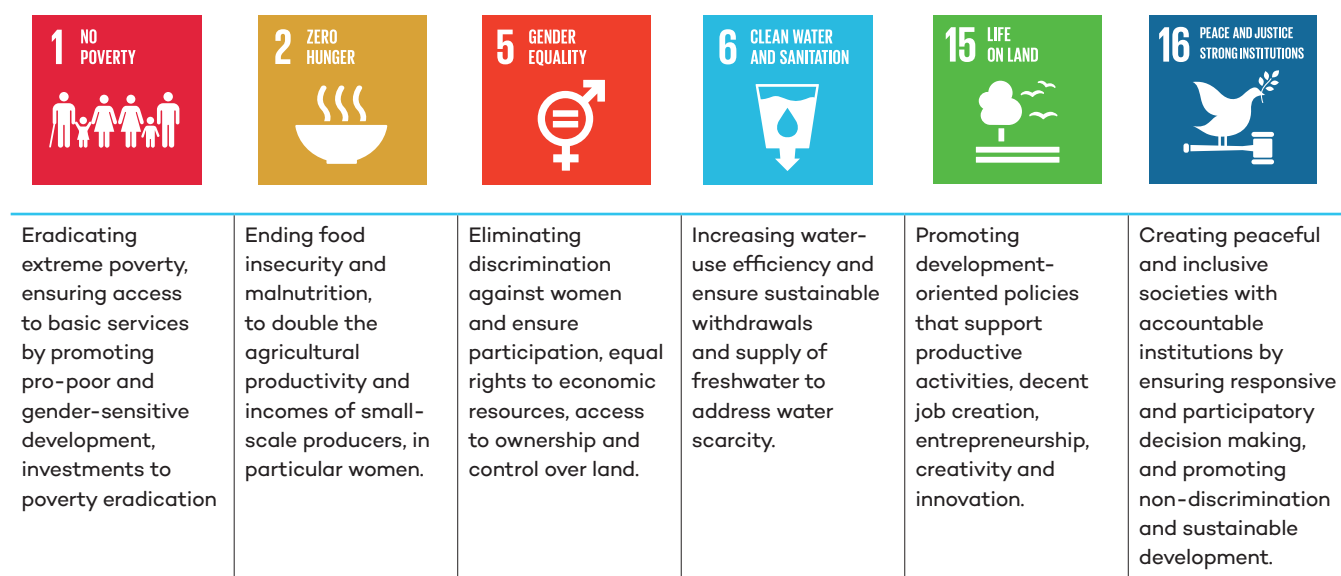
Table 2. SDGs that provide direct input into the design of land investments

In this way, this subset of SDGs can be used to frame future studies to ensure that all critical aspects of land investments are considered, thus ensuring synergies across economy, nature and livelihoods are maximized and trade-offs are minimized.