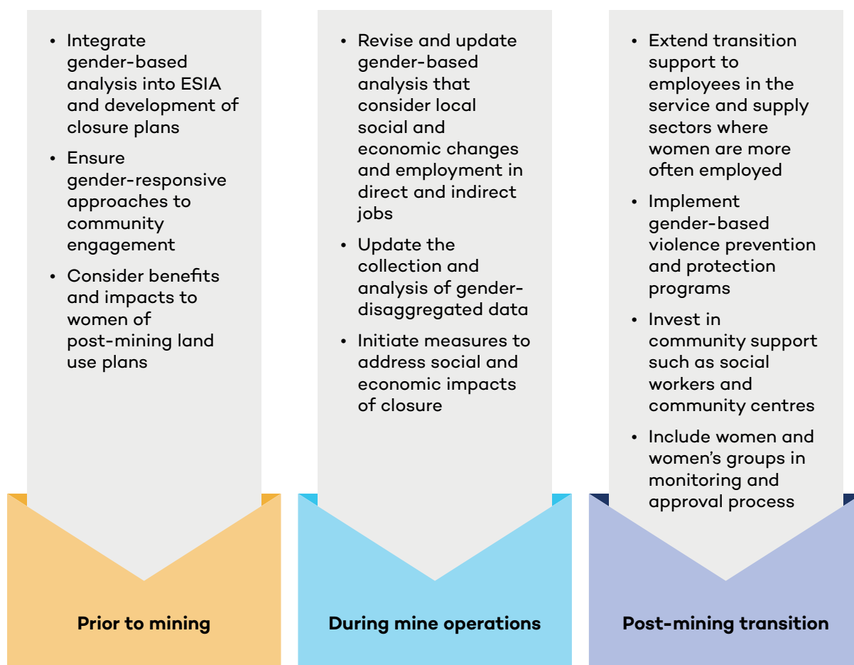
FIGURE 2. Intersection of gender equality and mine closure over the mine life cycle

and continues through to the social and economic support that mine operators and government provide to communities in the post-mining transition. The key areas of intersection between gender equality and mine closure are discussed below and outlined in Figure 2.