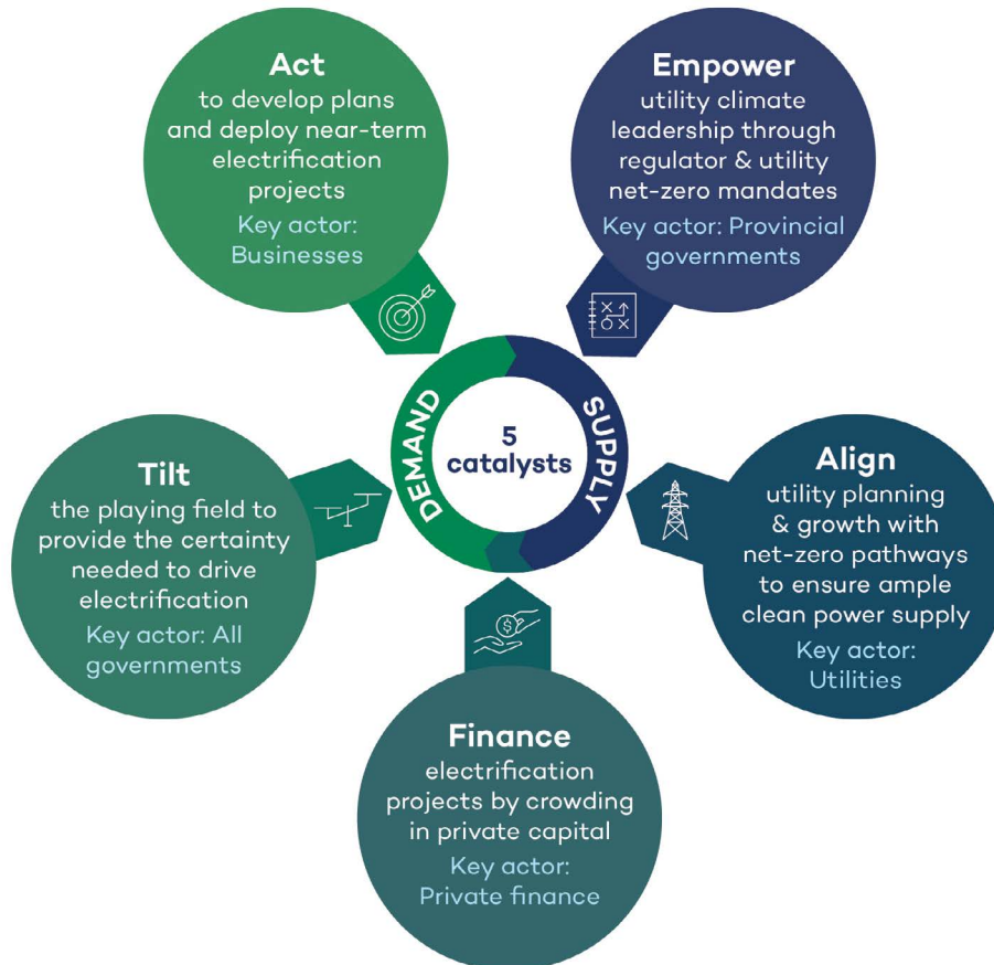
Figure 2. Five catalysts to accelerate electrification

Failure to do so means losing out on our competitive advantage, vastly increasing transition costs and risks, and foregoing significant opportunities.