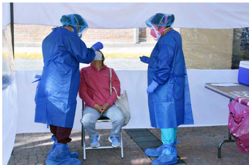
A COVID-19 testing site in Xochimilco, Mexico.

COVID-19 resource mobilization can steer green recovery not only to “build back better” but to take up long-held environmental sustainability and health evidence to effectively safeguard against future pandemics and