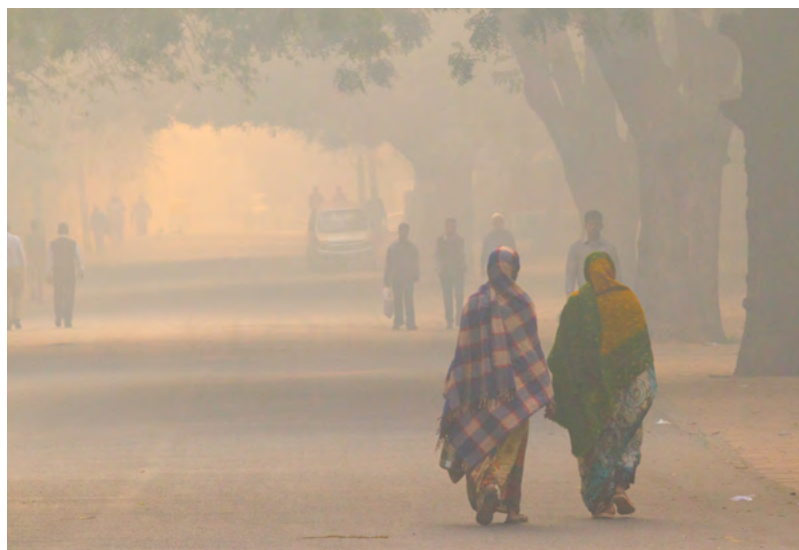
Respiratory disease associated with air pollution is rampant, especially in cities like New Delhi, India, where air quality has plummeted over the last few years.

Human health in the Anthropocene requires an integrated approach. In 2015, the Lancet medical journal in partnership with the Rockefeller Foundation published a landmark report alerting the medical community that humans had damaged the Earth's natural systems to the point of causing reciprocal risk and damage to human health. The report underlined the urgency and opportunity to address modifiable environmental factors to reduce the global burden of disease and launched an international call for world leaders and experts to support a transdisciplinary approach called “planetary